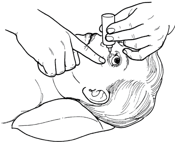
Dropper and hand position for administering eye drops.